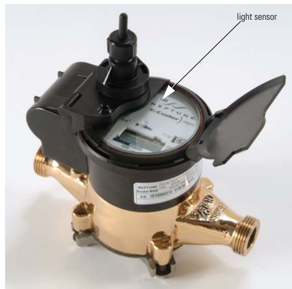
Figure 4 Activating the LCD

The light sensor is recessed under the small round hole near the center of the dial face. The hole is marked with a flashlight graphic (see figure). The light sensor activates the LCD display for several minutes when the unit is exposed to a light source. For example, a unit mounted in an inside location would turn on the LCD for several minutes after the room light is turned on. A unit mounted in an outside pit would turn on the LCD for several minutes after the pit lid is opened exposing the unit to daylight. If the LCD is currently off, the LCD may be reactivated by covering the dial plate with your hand for about two seconds. In bright sunlight, it may be necessary to close the cover or the pit lid momentarily. If the LCD does not reactivate as expected, try shining a flashlight on the light sensor.